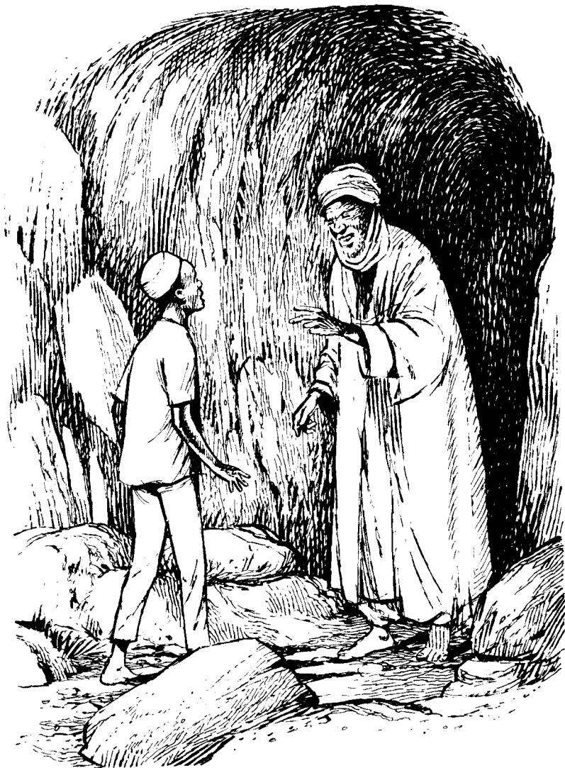
A very old man came up to me.